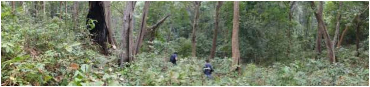
Forest of Quebube