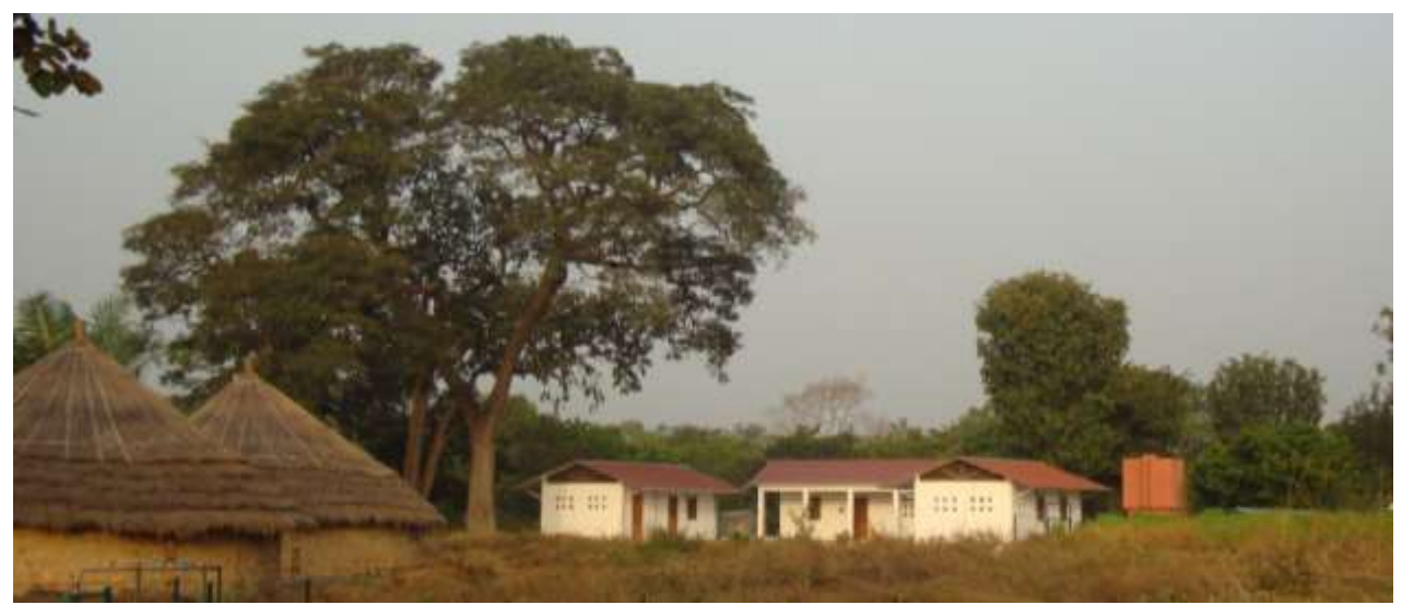
Casa Daridibó with to the left the back side of two bungalows of the Fonda Huuwa camp site