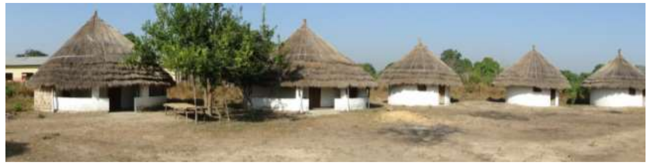
The Fonda Huuwa camp site in Beli

Goal II Fruitful cooperation with the IBAP team that is based in Beli to implement the GEF/PNUD project on the establishment of the Boé National Park.