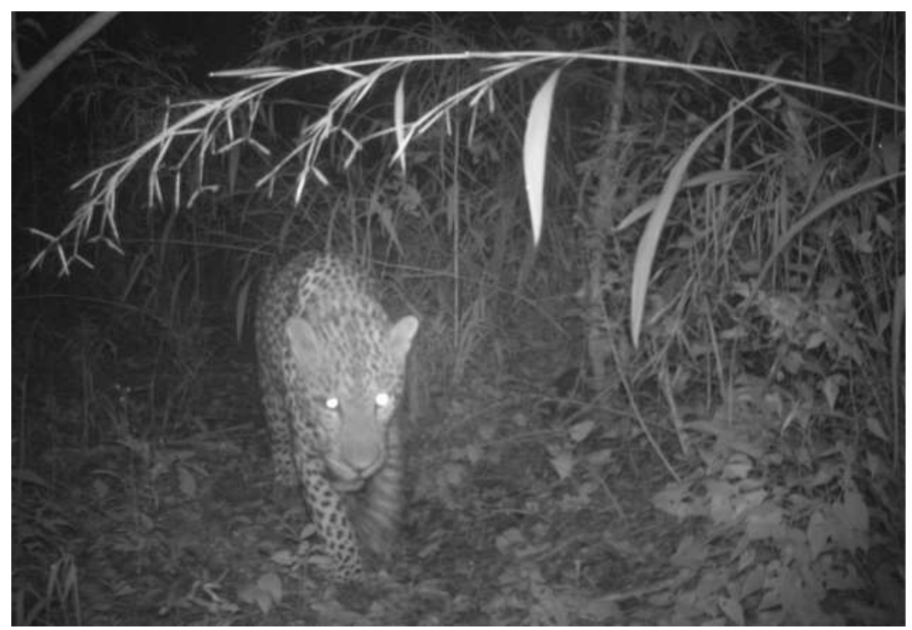
Leopard (camera trap near Beli)

The CVV program aims to convince the local population of the importance of sound natural resource management and the rights of the chimpanzee population on a place to live in the Boé: also in the future. For the moment legal means lack to prevent dangers like increased replacement of natural forest by cashew plantations and the expansion of and resulting damage by cattle herds.