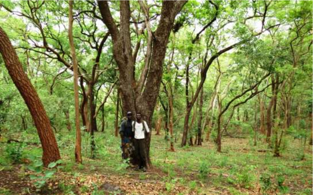
Field trip during PANAF survey (chimpanzee nest visible)

End of November 2014 all samples collected had been sent to MPI in Leipzig and an enormous amount of images and data has been made available. It will take several years before all samples, images and data are duly analysed and results published. We are proud of the quality of all material which has been collected thanks to an enormous amount of fieldwork by many expat volunteers, students, our local staff and field guides.