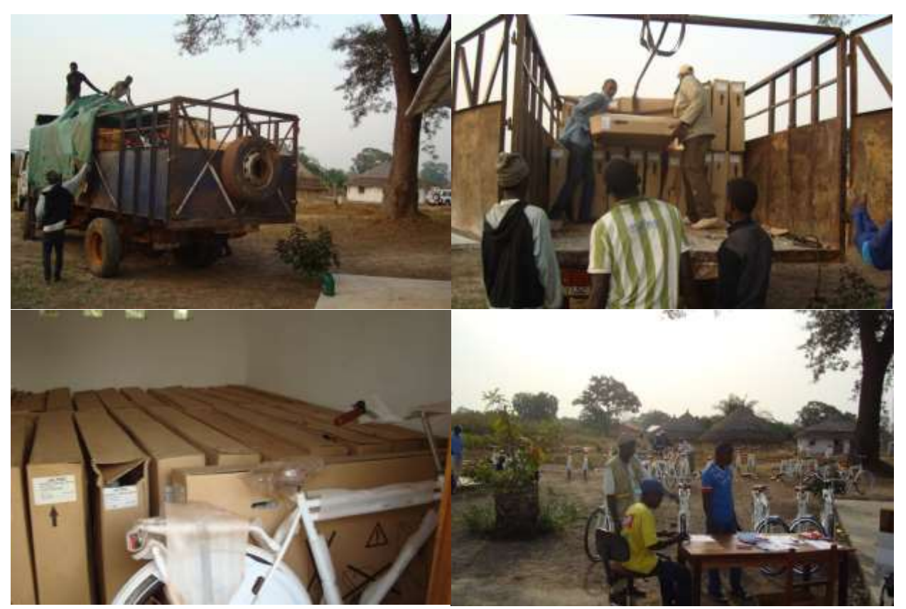
Transport of bicycles and ceremony to sign contracts with CVV members on bicycle usage

At their start every CVV had been given a locally acquired bicycle for the women and one for the men to use for the work of the CVV (transport to a training, to come to Beli for a meeting or for reporting on patrols and poaching etc.) and all members are supplied with a uniform and boots. After 5 years of field work they needed new bicycles and uniforms. We have handed out new bicycles to all CVV's in 2014; this time more sturdy ones that we imported from the Netherlands. Every CVV member had to agree on and sign for the conditions of use. We have started to make identity cards for every CVV member which will give them authority but also the responsibility to behave as an example to others.