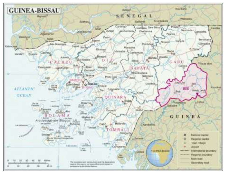
Guinea Bissau and the area in which Chimbo is active, marked in red