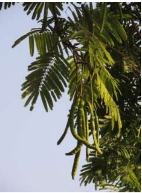
Faroba: nutritious both for humans and chimpanzees