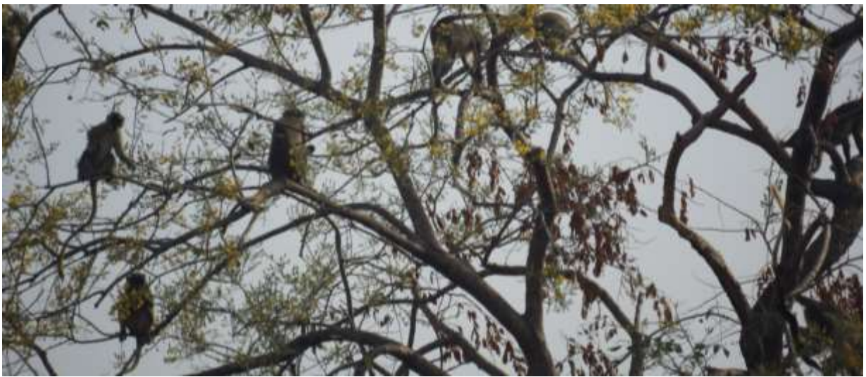
The green monkey, a species that is abundant in the Boé