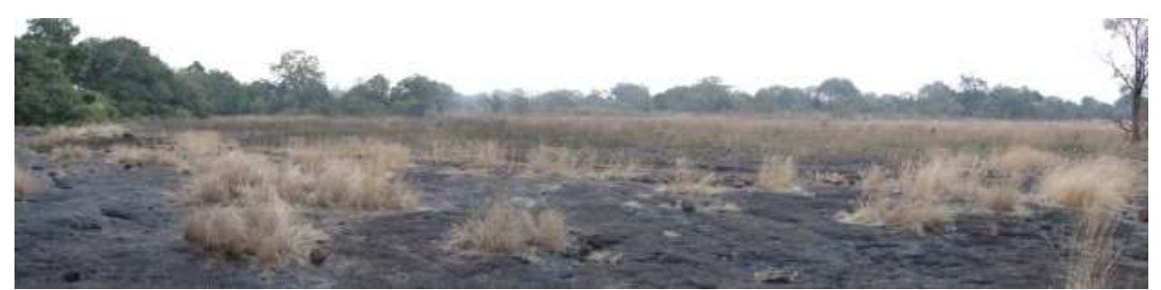
Boé landscape: laterite soil with savannah and gallery forests

Chimbo's policy is to initiate own programs and activities or act as a catalyst for policies and actions that help to achieve the goal of a sustainable thriving chimpanzee population in West Africa. The Boé area is the geographical heart of our activities.