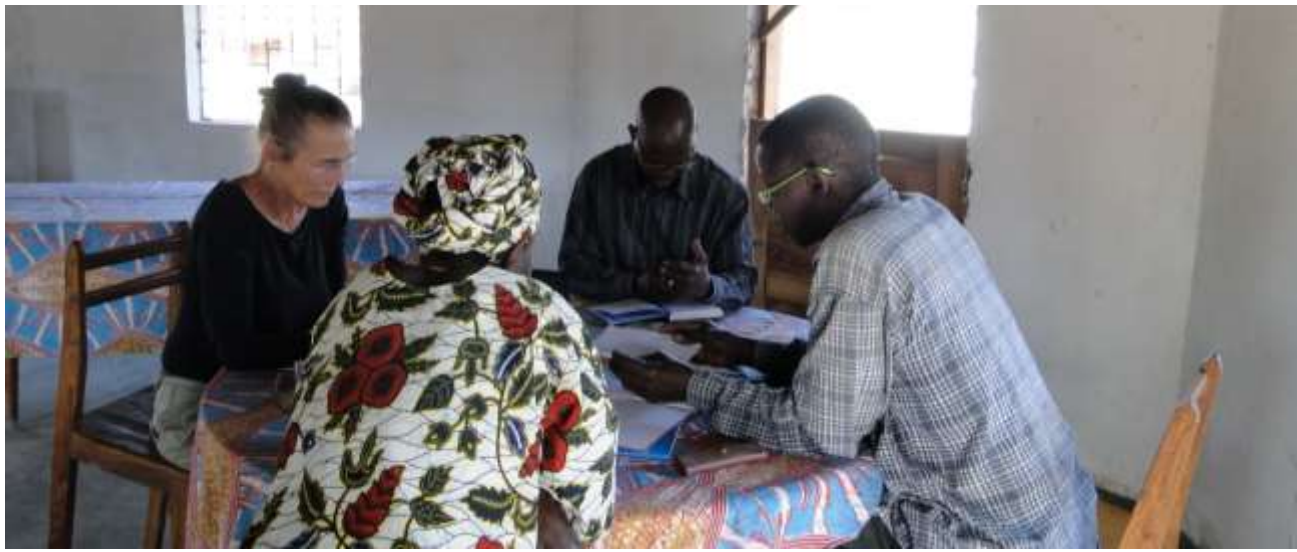
Control of the administration of the rice bank of Beli