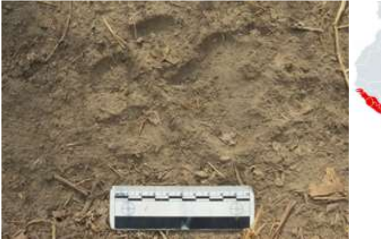
Lion track found in Aicoum

An unexpected result of this survey was the proof gathered that lions are coming back to Guinea Bissau after decades of absence according to official reports. Everywhere else in West Africa lion populations are diminishing. Even more spectacular was the first proof with a film made by a trail camera of an Afican golden cat in Guinea Bissau. The first confirmed record of the animal for the country and the first one in more than 20 years for West Africa.