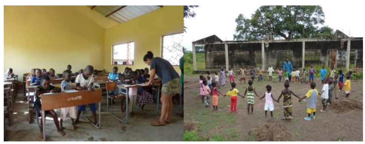
Citizenship classes - How to be an environmentally conscious citizen.

For awareness raising twice a week (one session for children and one for youngsters and adults) movies in which nature conservation or safeguarding of the environment are illustrated, were shown and discussed.