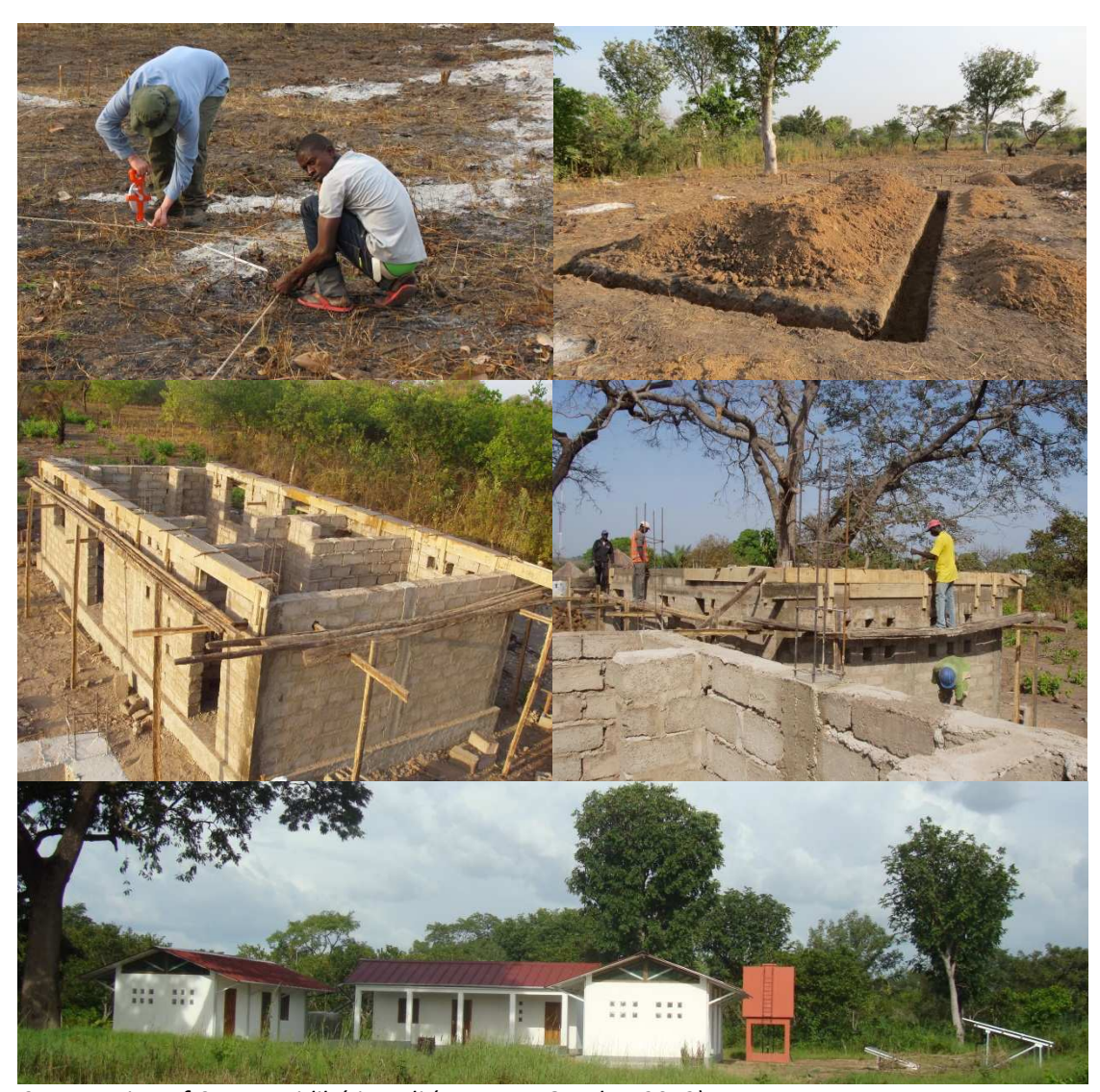
Construction of Casa Daridibó in Beli (January –October 2013)

• The Fonda Huuwa tourist campsite that burned down in 2010, has been restored with our help and can now lodge between 9 and 15 people. In 2013 over 1000 visitor-nights were counted for the camp.