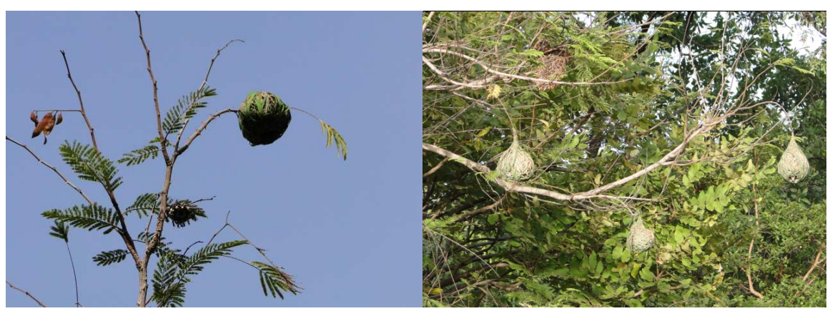
Vitelline masked-weaver associated with a paper-wasp nest in the same acacia tree.

• The pictures of mammals that we could provide to IBAP for their guide on the mammals of the National Park of Cantanhez are a valuable by-product of our research program.