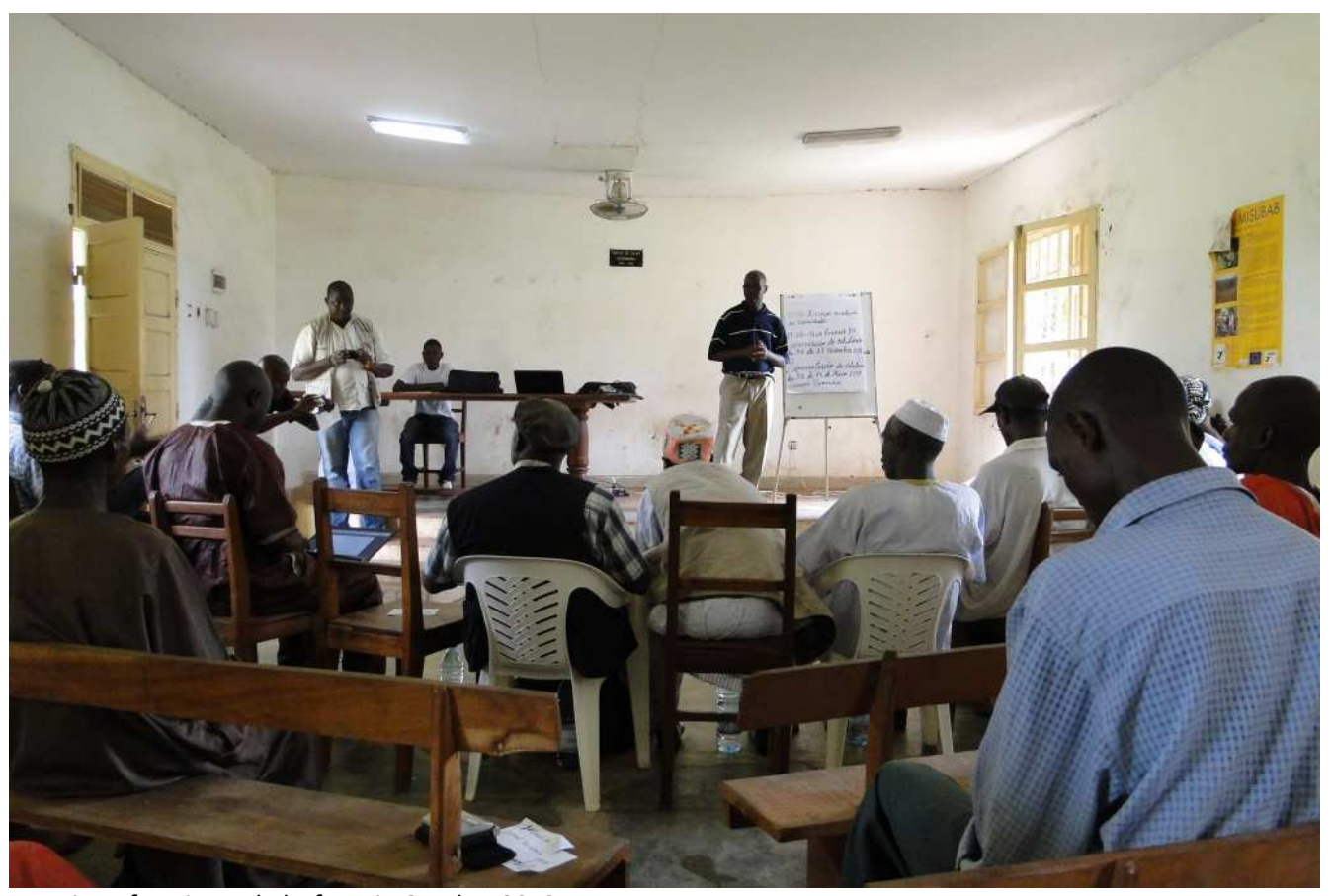
Meeting of Horizontal Platform in October 2013