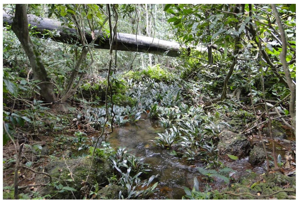
A small spring in the sacred forest of Munhini (threatened by future mining): a site of rich biodiversity

The objectives are translated by the Board of Chimbo in long-term and annual goals that are instrumental in the realisation of our mission.