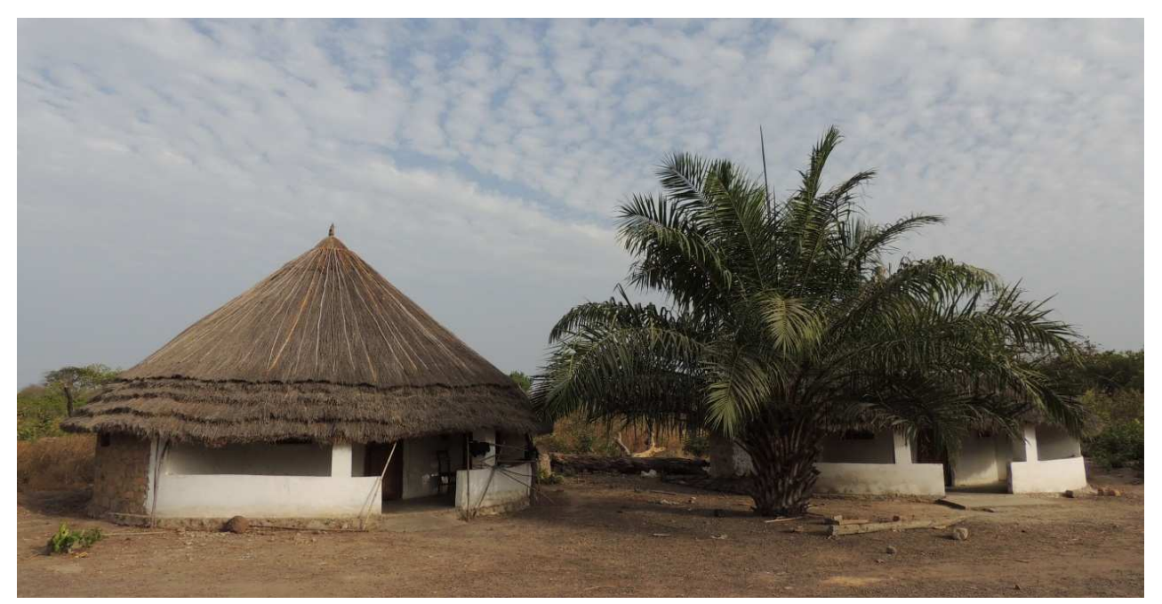
The Fonda Huuwa camp site in Beli

Goal II Fruitful cooperation with the IBAP team that will be based in Beli to implement the GEF/PNUD project on the establishment of the Boé National Park.