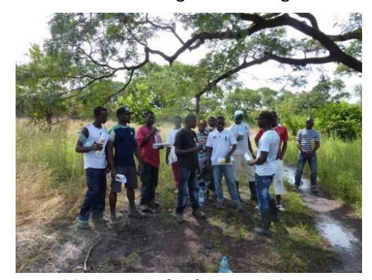
Field excursion for future guides