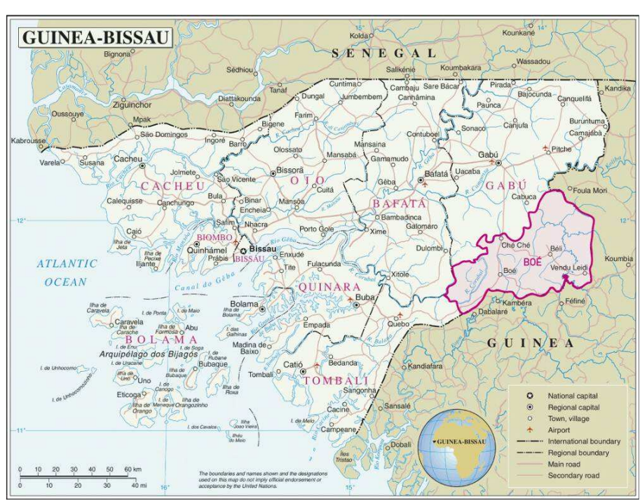
Guinea Bissau with the area in which Chimbo is active, marked in red